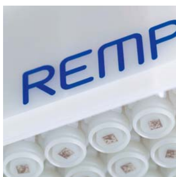
Storage Tube Rack with 2D Code

“We depend on very high quality screening to be able to find highly selective, target-specific compounds. We screen kinases, proteases, phosphatases and some ion channels and we can pick compounds with any selectivity profile we want. If our compounds were not of sufficiently high quality then all our screening efforts would be effectively useless. This also has ramifications for all of our disease research areas. For one of our inflammation projects, for example, we have worked on a p38 \alpha inhibitor. Using our industrialized drug discovery platform, of which the REMP system is an integral part, we have been able to pick a p38 \alpha selective compound while most people are working on p38 \alpha /p38 \beta dual inhibitors! Overall, we have been extremely pleased with the system, it has made a big impact on our daily routine as well as on the quality of the compounds and data tracking.”