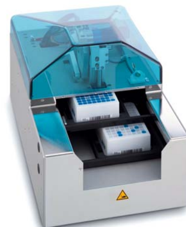
Tube Punching Module

A high quality sample storage system such as REMP's is essential for Amphora as the company puts significant effort into ensuring that all of its compounds are of the highest quality. All of the compounds in the library are purified by LC/MS and are all more than 95% pure. Using analytical chemistry techniques,